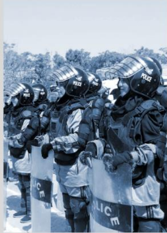
Cover image: Establishment of Balochistan's All-Women Anti-Riots Squad